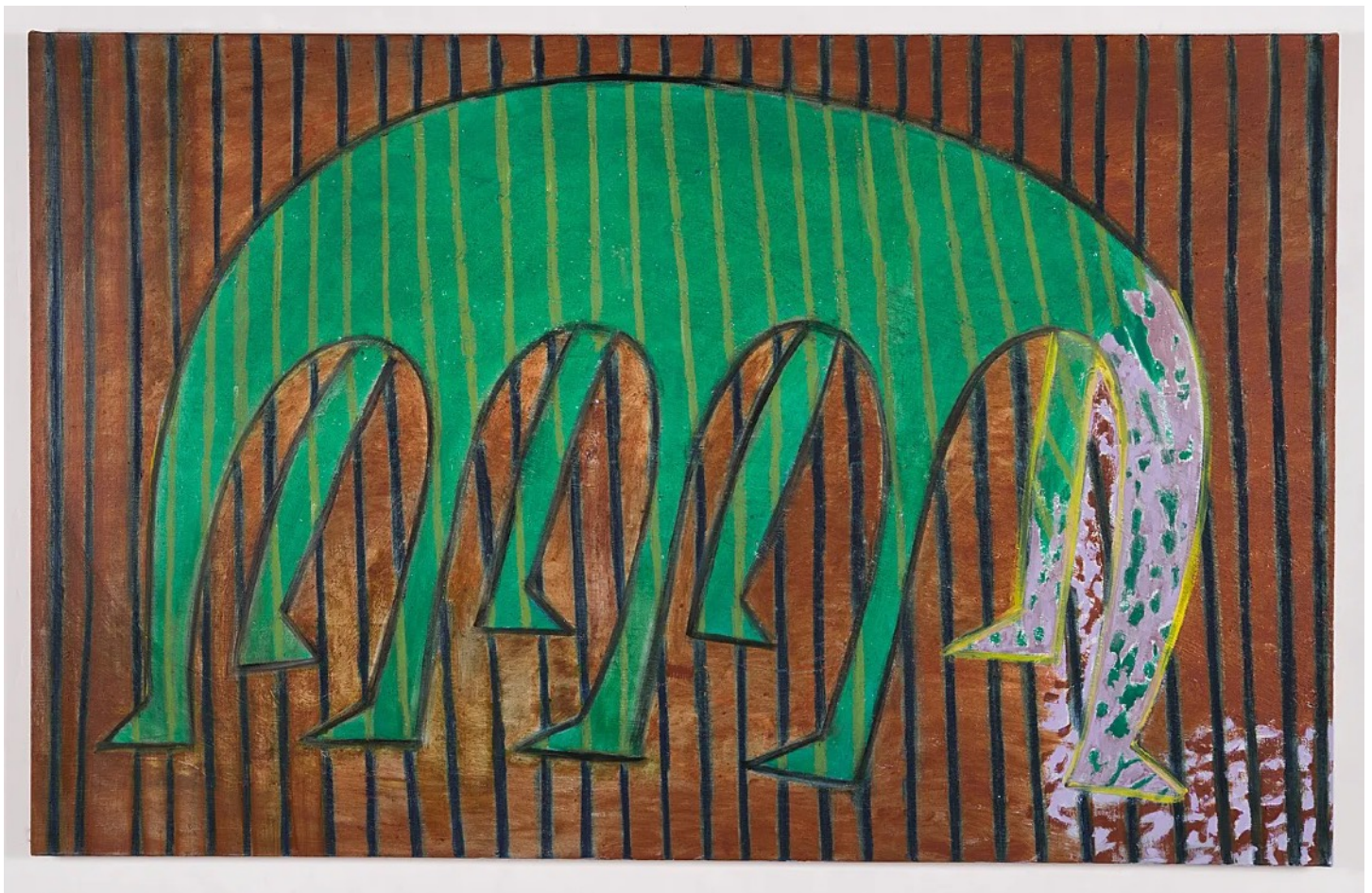
Aaron Maier-Carretero, Hut Hut , 2025, oil on linen, 38 x 60 inches.