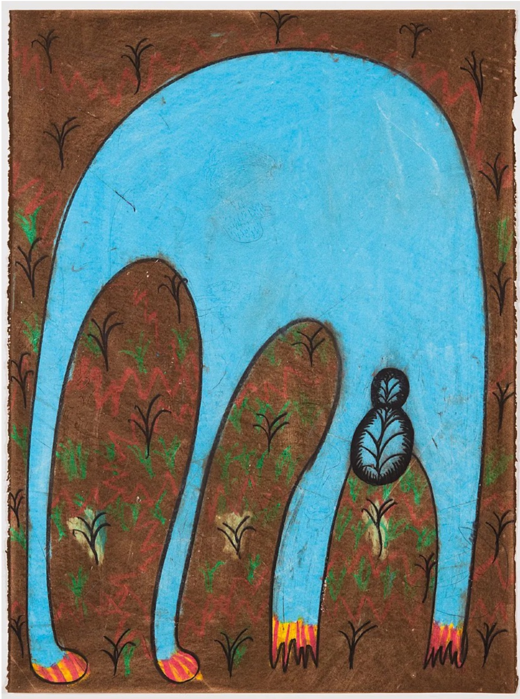
Aaron Maier-Carretero, Chute , 2025, oil pastel on paper, 30 x 22 inches.