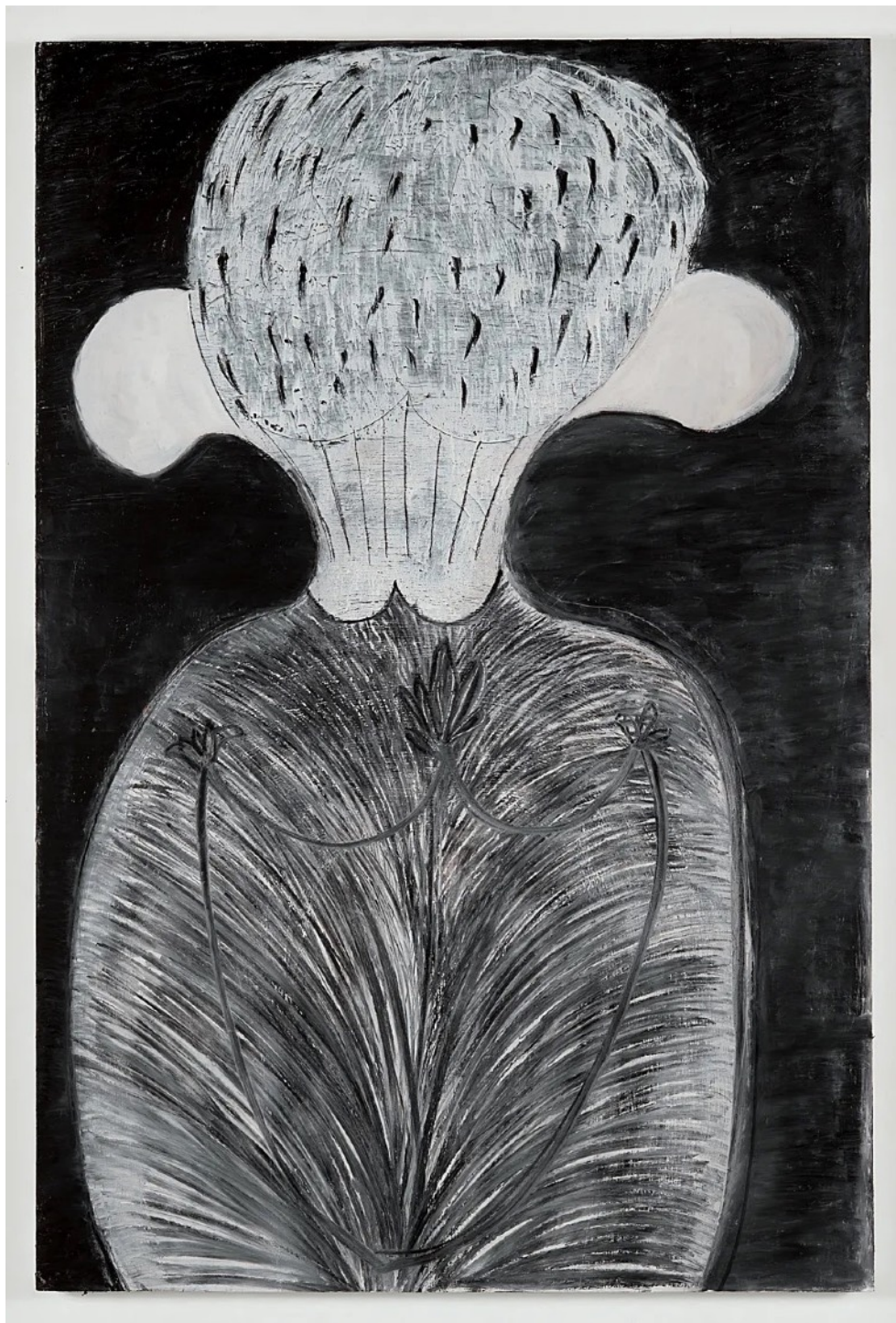
Aaron Maier-Carretero, Kaput , 2025, oil and oil pastel on polyester, 60 x 40 inches.