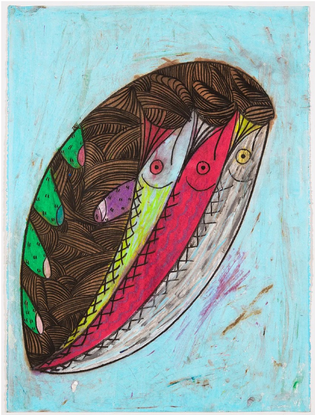
Aaron Maier-Carretero, Clamfish , 2025, oil pastel on paper, 30 x 22 inches.