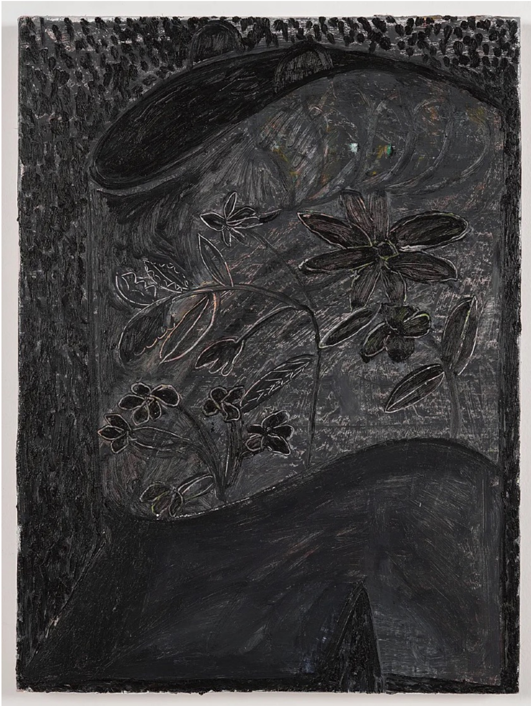
Aaron Maier-Carretero, Booty , 2025, oil on linen, 30 x 22 inches.