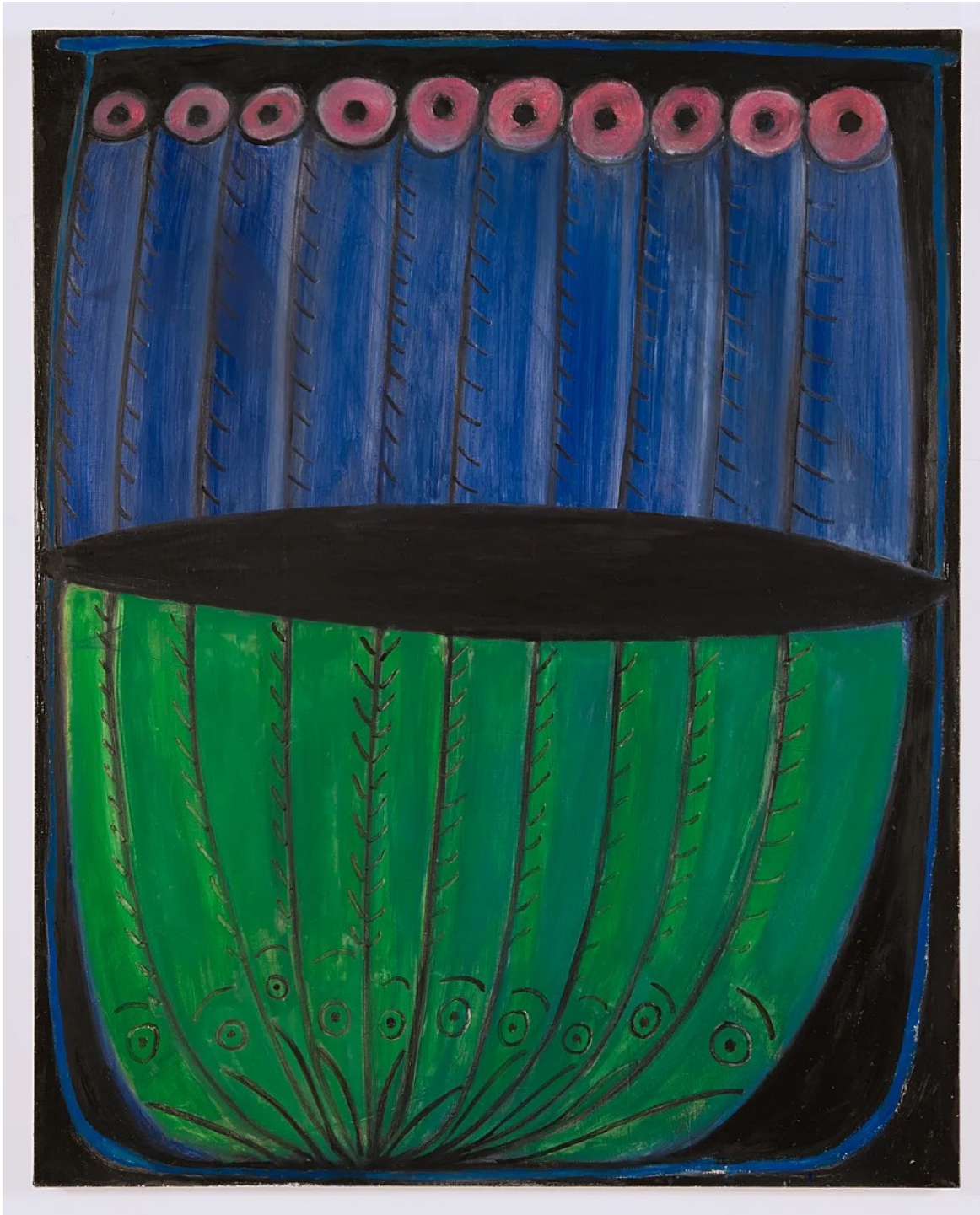
Aaron Maier-Carretero, Jarfish , 2025, oil on linen, 50 x 40 inches.